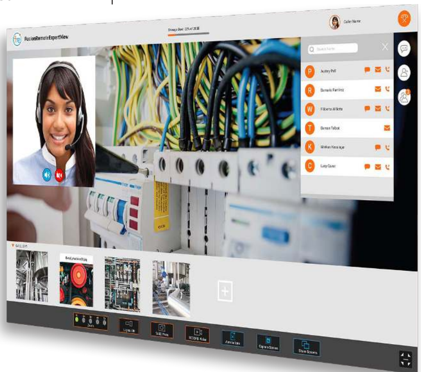
Fusion Remote Premium with Expert View, the uniquely designed dashboard for the remote expert

ALL LICENSES ARE ANNUAL & BY CONNECTED WORKER DEVICE